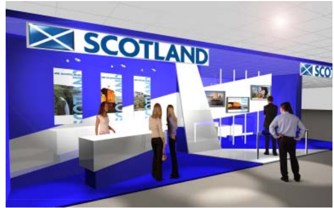
Artist's impressions of conference stand

Edinburgh City Centre Development and Waterfront Edinburgh recognize the importance of publicising the many opportunities within the city for the above groups and have participated at MIPIM for a number of years. This year Edinburgh is joining Scottish Development International (SDI) on the Scotland stand to engage and demonstrate the benefits of investing in our thriving city region.